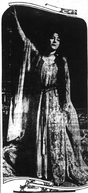
MME. FRANCES ALDA.

Metropolitan opera prima donna, who will sing in concert tonight at the Atlanta theater.